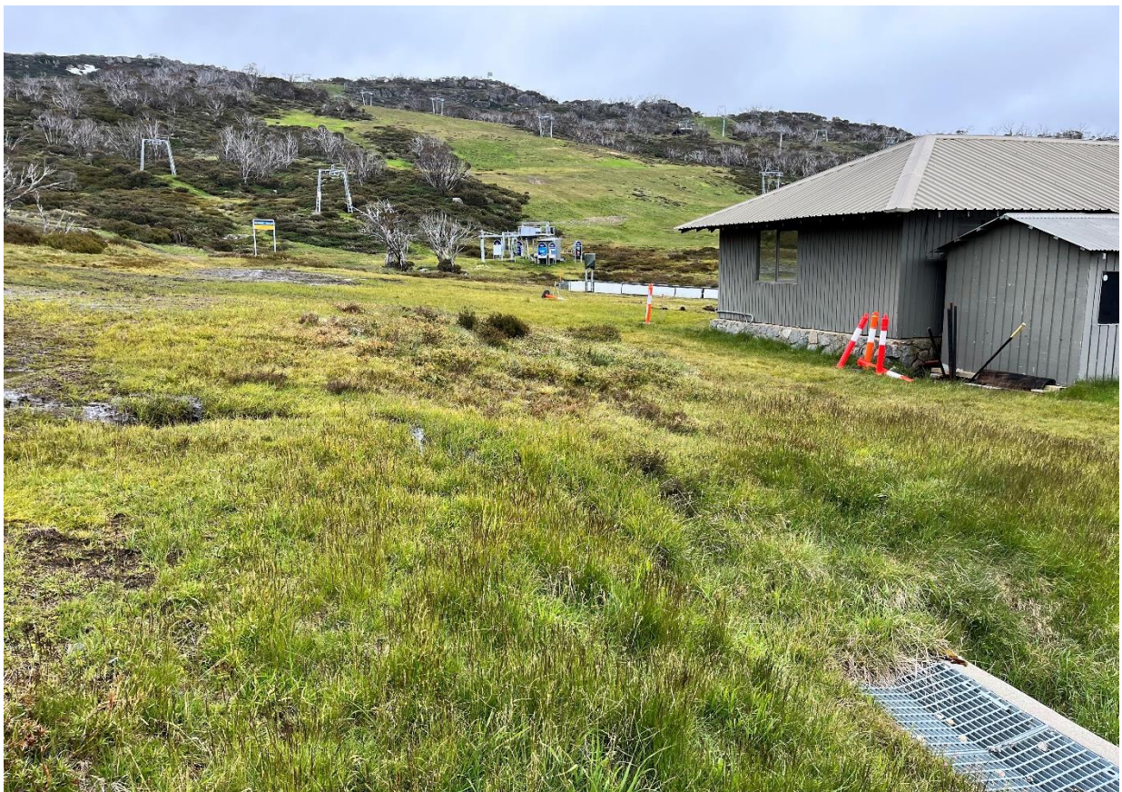
Photo 4: Looking west showing disturbance around the existing workshop.