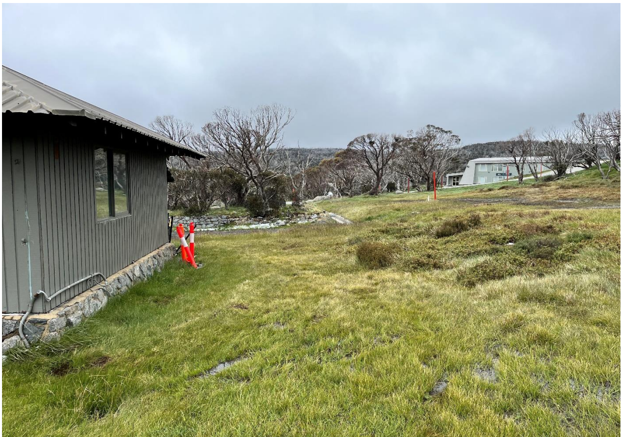
Photo 2: The small patch of remnant bog/wet heath to the south of the workshop is surrounded by heavily disturbed areas.