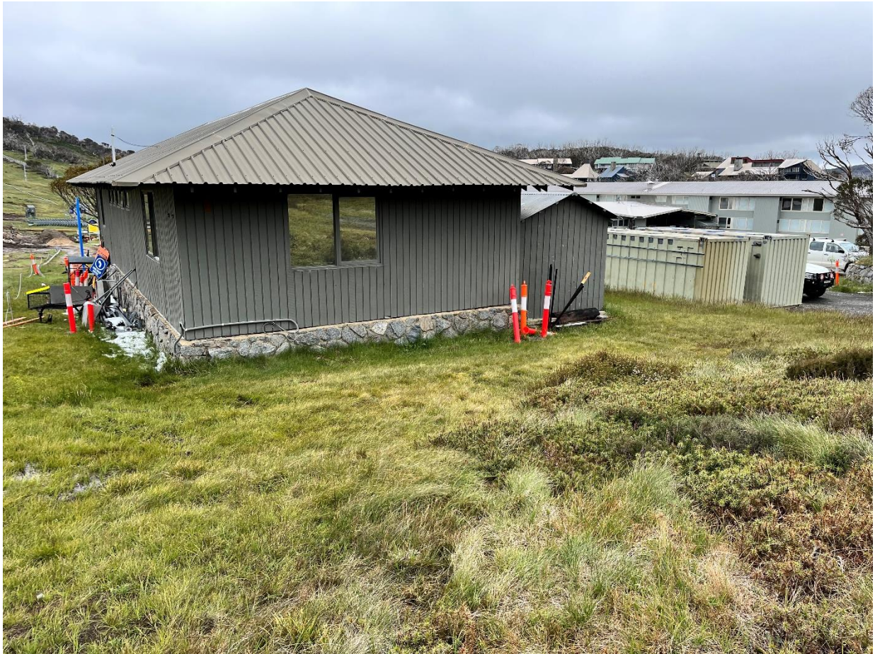
Photo 3: Looking north showing disturbance around the existing workshop.